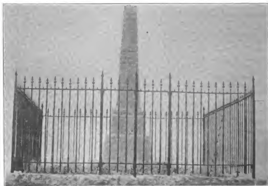
OGDEN MONUMENT AT FORT RILEY. (Geographical Center of U. S.)

the Marais des Cygnes massacre of May 19, 1858, and two stones stand in the gulch 5 miles northeast of the little town of Trading Post. On Aug. 30, 1877, the 21st anniversary of the battle of Osawatomie, a monument was unveiled upon the field. It is called the John Brown monument and bears the inscription: "In commemoration of those who, on the 30th of August, 1856, gave up their lives at the battle of Osawatomie in defense of freedom. This inscription is also in commemoration